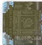
Assistant Engineer (Civil) Building Department / Borough-XII The Kolkata Municipal Corporation

8. One set of plans and specifications submitted along with the notice under Sub Rule (i) of Rule 4 duly countersigned is returned herewith.